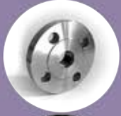
Part no.: NP TF10-NPT Stainless steel threaded flange Φ105mm, thread 1" NPT