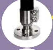
Part no.: NP CC SET Coupling SET