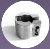
Part no.: NP CF10 Stainless steel compression fitting incl. bolts