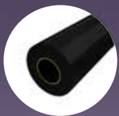
Part no.: NP-LPG25-100 LPG pipe DN25, (OD51), packing: 100m coil