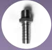
Part no.: NP IC10-NPT Stainless steel insert coupling Φ25mm, thread 1" NPT